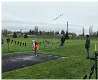
Middle School Track Boys win against Amity. Everyone gets fit. A real world win-win situation...see below