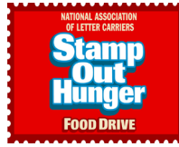
Stamp Out Hunger The largest one-day food drive in Oregon and the nation is Saturday, May 12, 2018