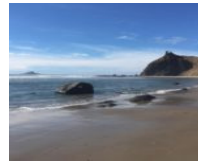
Best Beaches Roads End, D-River, and Taft Bay made our list. Full story on our website.