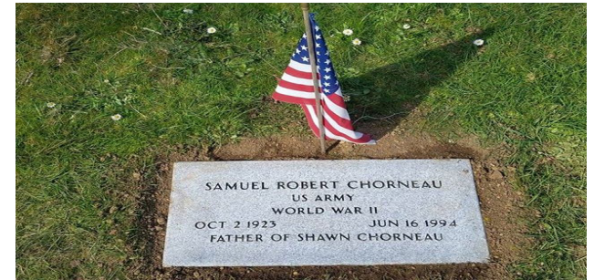
Pacific View Memorial Cemetery has heeded concerns of local Cub Scouts and accomplished its mission of honoring our military Veterans by marking the graves of the unnamed fallen.