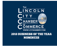
Biz of the Year Chamber of Commerce nominations are up and we'll all know soon...see below