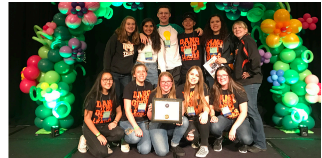
Taft High Student Council