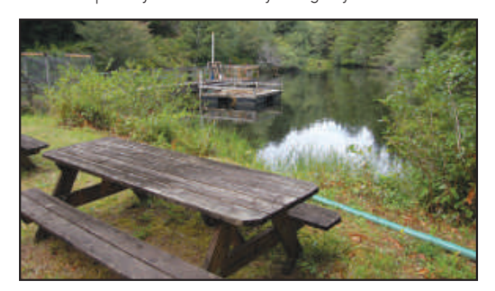
WATER: Jerome believes Depoe Bay must protect its pure drinking water supplies from self-serving, outside interests and insure our reservoir and delivery systems are in working order.