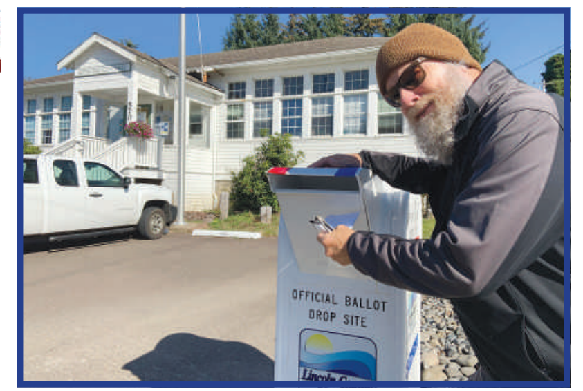
Use our new official "Ballot Box" at City Hall!